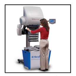
SpeedyPacker® Foam Packaging System