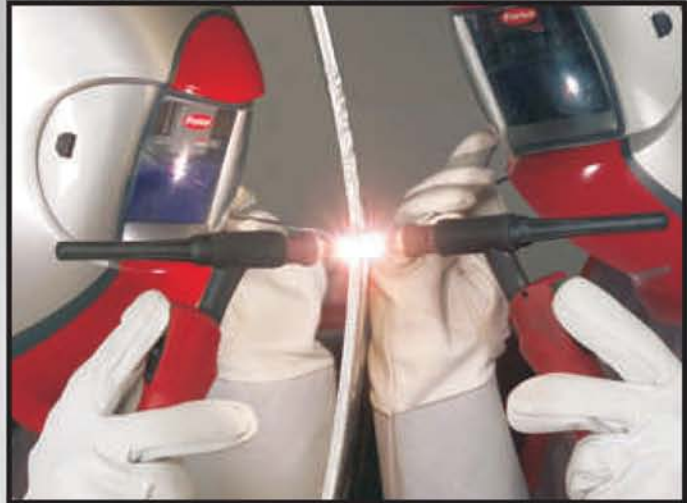
Mig & Tig Welding