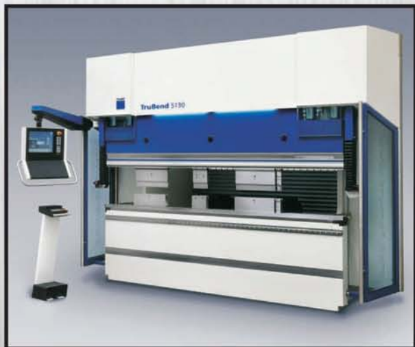
Folding & Bending

P.O Box 1102, Bayswater Business Centre Bayswater, VIC 3153 43 Malvern Street, Bayswater Vic 3153 Email: sales@newtouchfab.com.au